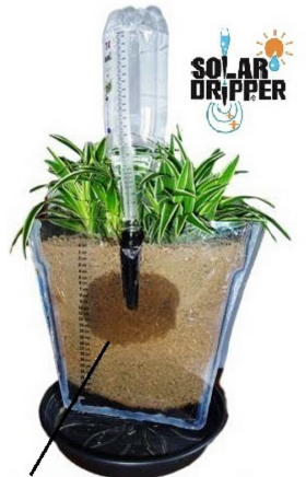
Wet bulb deep in the roots

Some gardeners have found success with additional tools, such as the Oriaz Solar Dripper™, drip tape, and other irrigation/fertigation equipment